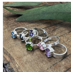
Week 3 & 4